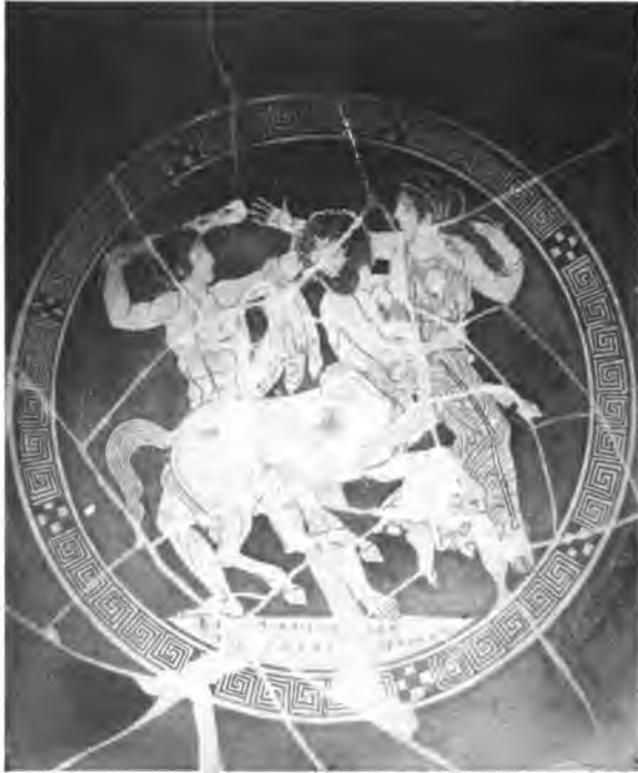
Fig. 71. Nessus running off with Dejanira.

ried off the princess I'ole as his captive. Stopping on his way home to sacrifice to Zeus, he sent a messenger to get him a suitable garment to wear